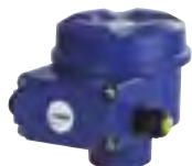
Aluminium housing, flameproof design with increased safety