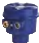
Aluminium housing, flameproof design