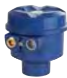
Aluminium housing, flameproof design