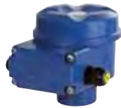
Aluminium housing, flameproof design with increased safety